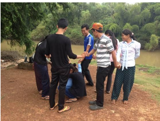
YSG leaders team building