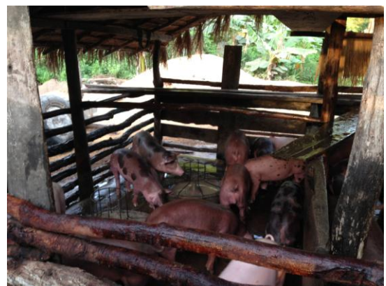
Pig raising loaned by Saving & Credit Group