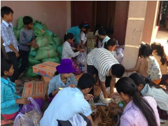
Distributed Rice and Foods in flood season