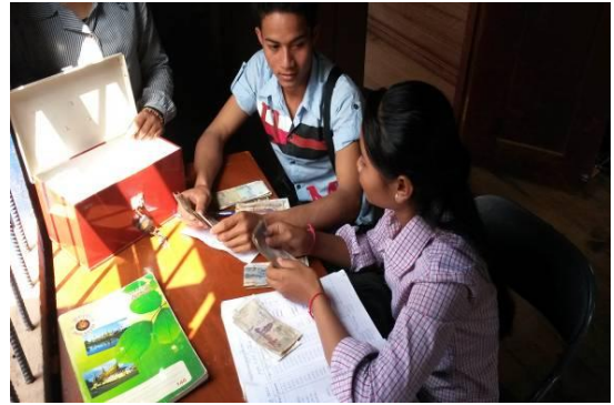
Saving and Credit Group activities